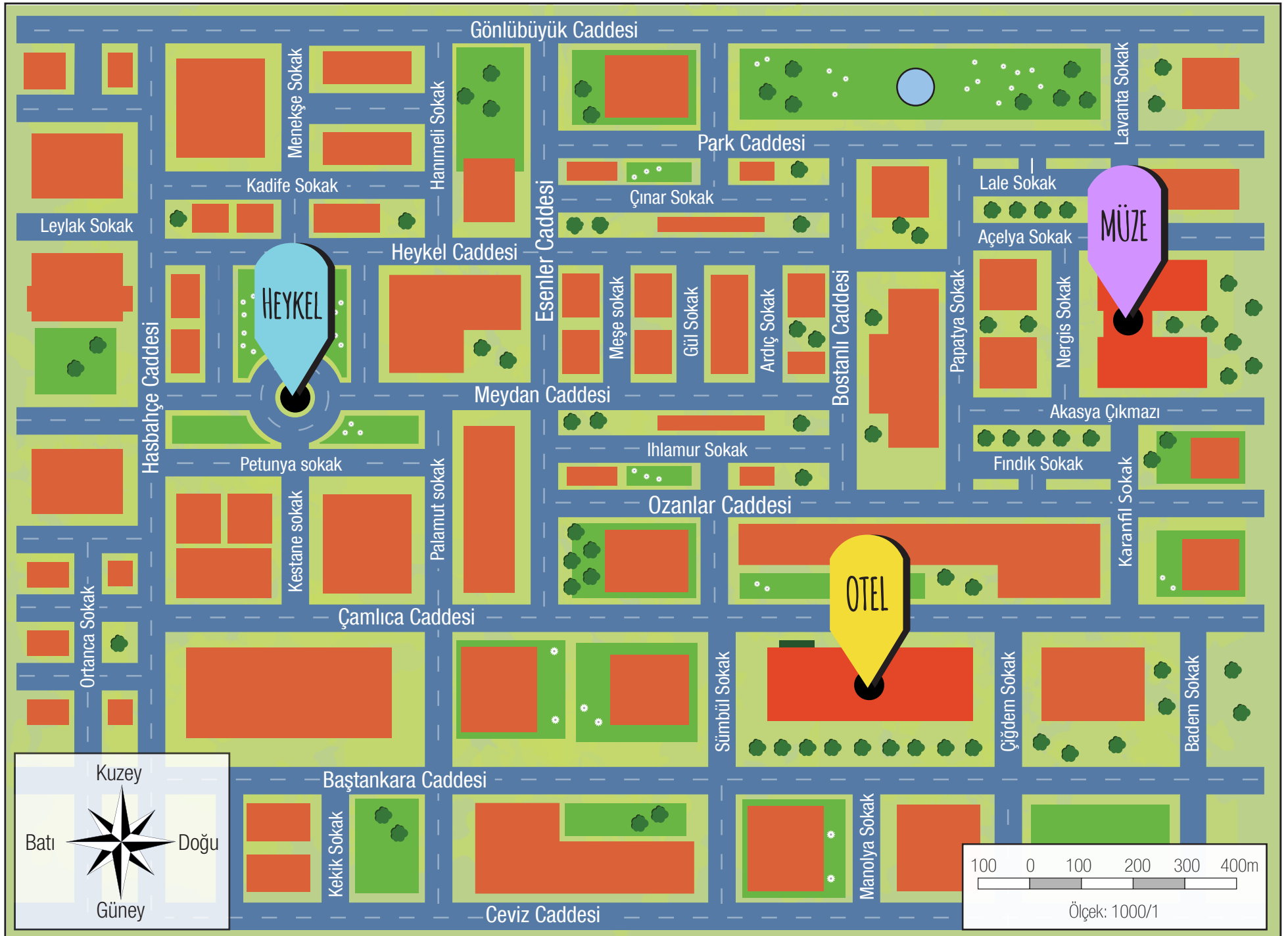
ADRES TARİFİ - HARİTA